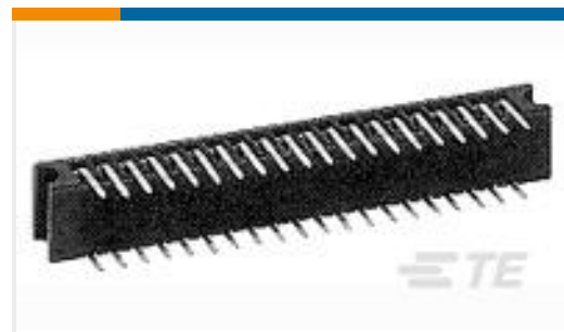
TE Part # 5-532956-3 20 MODII 2PC CE RCPT ASSY, RoHS