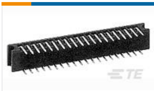
TE Part # 5-534204-9 20 MODU 2-PC CE RECP ASSY, RoHS